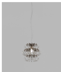
ECOS SP 35