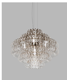
ECOS SP 90